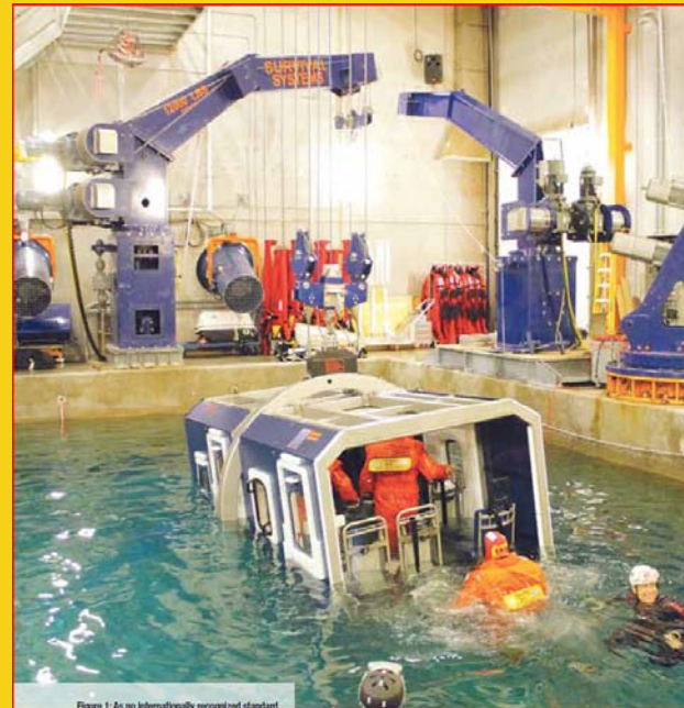
Figure 1-As an internationally recognized standard